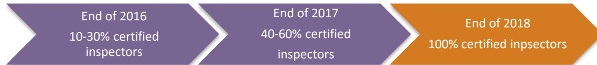
Fig. 2 Implementation Goals

The goal of the Associations' program is to systematically advance toward complete certification over a three-year period as depicted in Fig. 2. Each owner or operator can determine its own implementation timetable.